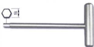
F66-760140 - T- Handle Hexagonal 4mm