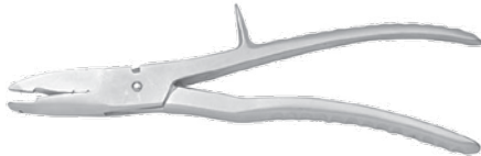
F66-324040 - Wire Cutter/Bender