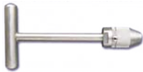
F66-763006 - Pin Inserter with locking device